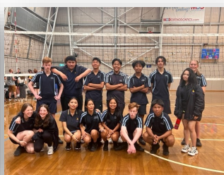
Intermediate Volleyball Teams