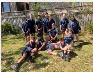
Junior Volleyball Teams

AFL, Soccer, Netball, Badminton, Girls AFL and Boys Netball