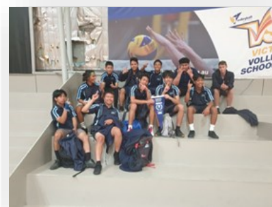
Intermediate Volleyball Team