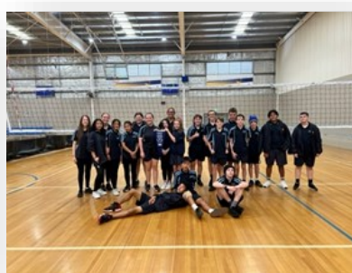
Junior Volleyball Team